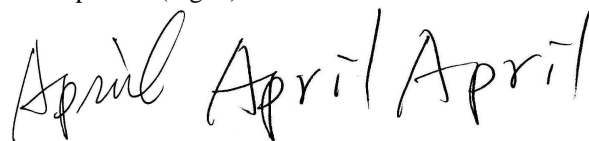
Figure 5. Different authentic writing style.

Also, there were a few cases where one of a writer’s three authentic writing samples differed in writing style – for example, one written cursively and two printed (Fig. 5).