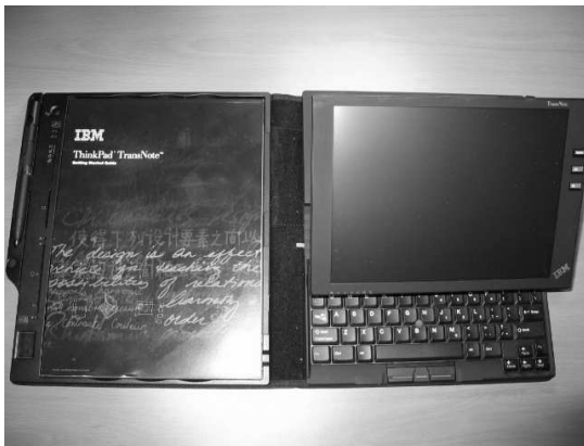
Figure 1. IBM TransNote, pen-enabled notebook PC.